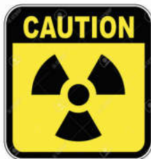
Industries related to radiation activities

Taking into consideration the wide range of the activities of the company in the field of environmental services and analysis, different organizations/companies especially in radiation services, could benefit the services this company presents.